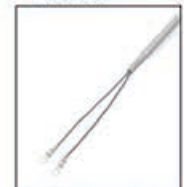
WC Ring terminal for \phi 3\sim 5\text{mm}

09 : for \phi 3 10 : for \phi 4 11 : for \phi 5