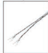
WT Spade terminal for \phi 3\sim 5\text{mm}

06 : for \phi 3 07 : for \phi 4 08 : for \phi 5