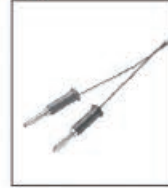
WA Sheathed banana plugs

06 : for \phi 3 07 : for \phi 4 08 : for \phi 5