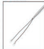
WC Ring terminal for \phi 3\sim 5\text{mm}

09 : for \phi 3 10 : for \phi 4 11 : for \phi 5