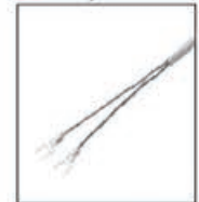
WT Spade terminal for \phi 3\sim 5\text{mm}

06 : for \phi 3 07 : for \phi 4 08 : for \phi 5