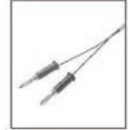
WA Sheathed banana plugs

06 : for \phi 3 07 : for \phi 4 08 : for \phi 5